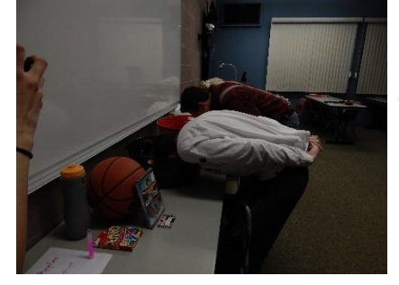
Winnemucca's Spook Night